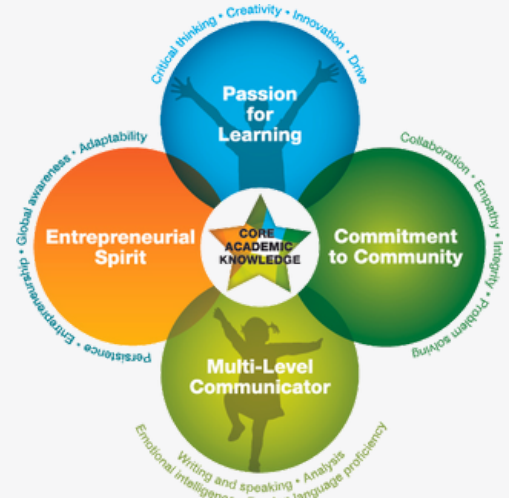
The North Star from Student Success 2025

Delawareans discussed the North Star throughout Town Hall events, and a new version will guide the 2035 plan. What were some of their top skills and attributes needed for 2035?