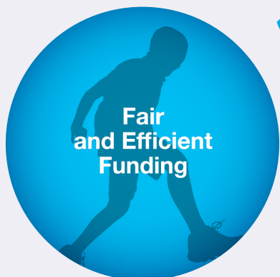
Fair and Efficient Funding

Support STARs and Purchase of Care investments