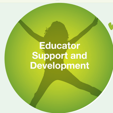
Educator Support and Development

Support $500K for employer engagement in work-based learning